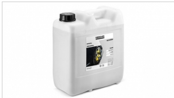
© Alfred Kärcher SE & Co. KG

Like the other products in the range, the biodegradable rim cleaner can be used with all water treatment systems.