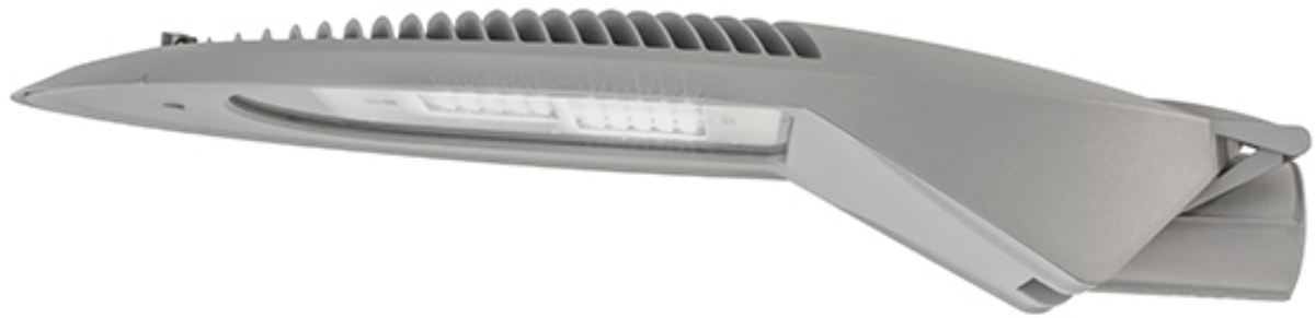
Ambiente XL EOS2 LED Luminaire

Thanks to Bever Innovations EOS technology, three wireless motion sensors detect traffic on site and control the luminaires in order to reduce the electrical consumption whilst ensuring safety and comfort for the users of site.