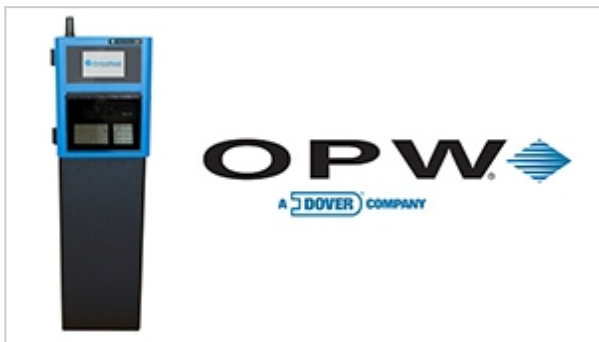
OPW's Petro Vend 200 Fuel Island Terminal

OPW Fuel Management Systems, part of Dover Corporation's Fluids segment, has introduced its new Petro Vend 200 (PV200) Fuel Island Terminal, which features many modular options that make it scalable for a wide range of unattended fueling needs.