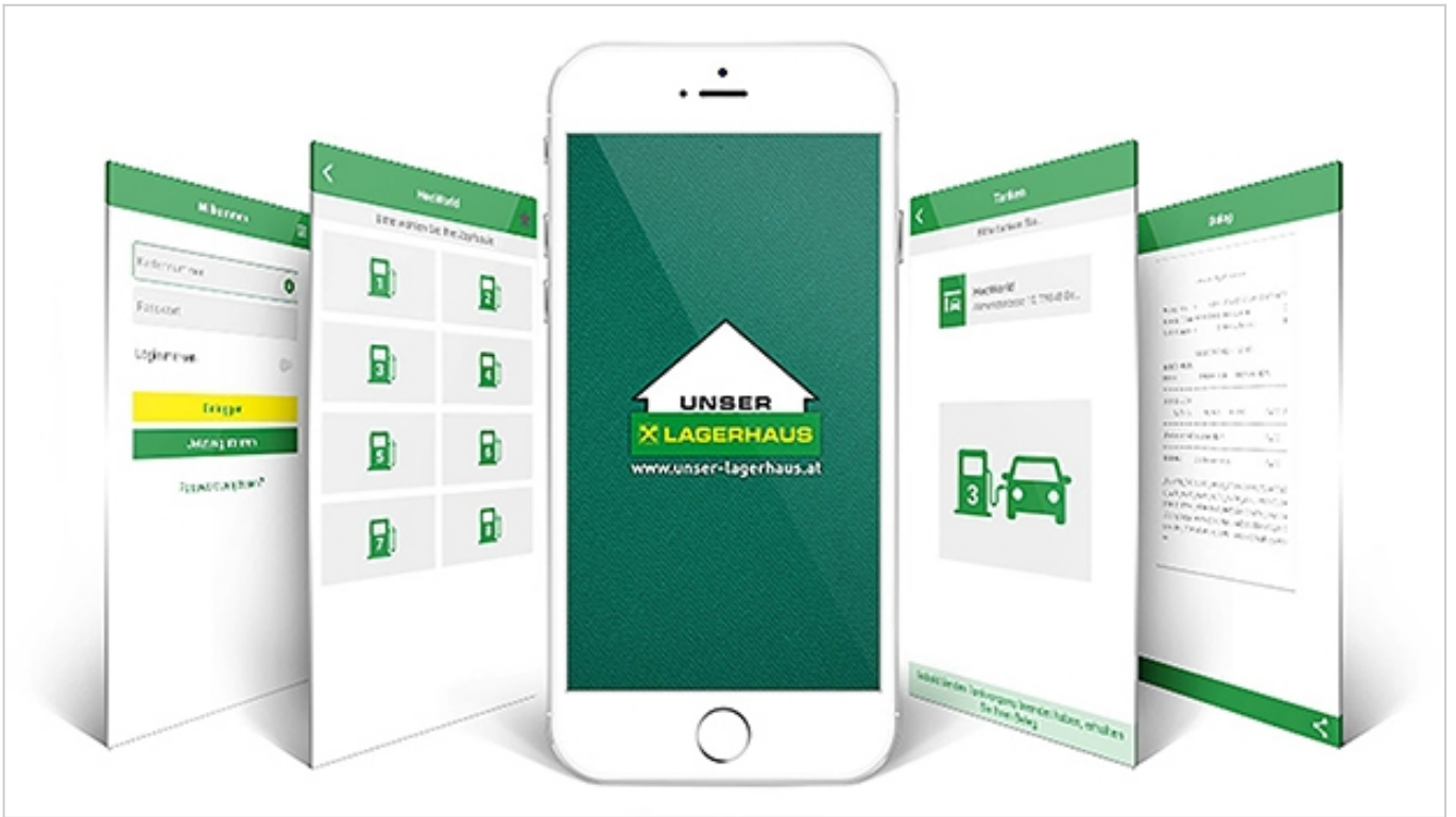
The new payment app Lagerhaus|Card in use. The user selects the dispenser conveniently via the app.