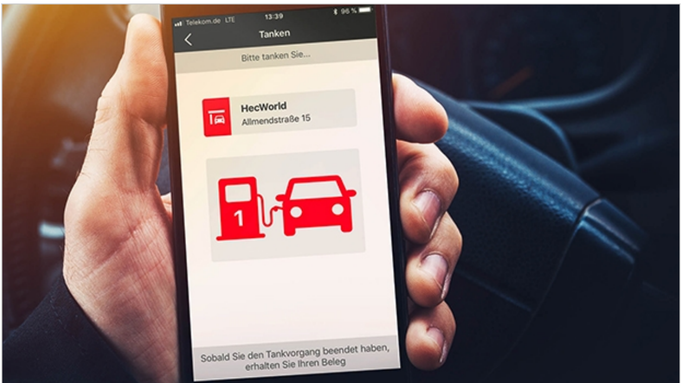
Payment app HecFuel - faster refuelling with the digital fuel card.

Quicker and easier fuelling processes for the customers and a comprehensive overview of transactions with administrative function. These were the clear goals of the Austrian „UNSER LAGERHAUS“ Warenhandelsges. m.b.H. for 2019. With over 20 full-service petrol stations in Carinthia and Tyrol “UNSER LAGERHAUS” is a reliable partner in energy matters for its customers. In order to offer its customers real added value in the future and to meet the challenges in the market with a digital solution “UNSER LAGERHAUS” once again opted for the expertise of Hectronic. Equipped with the cash register system HecPos-T the decision to digitize the physical fuel card in cooperation with the trustworthy partner Hectronic was an easy one.