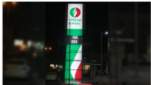
ENOC Saudi-Arabien

But the world moved on. Price displays are already mandatory for fuel stations in Jordan and Lebanon, Egypt is expected to follow from 2021, and the joint venture of Saudi Aramco with TOTAL makes the introduction of price signs likely even in Saudi Arabia.