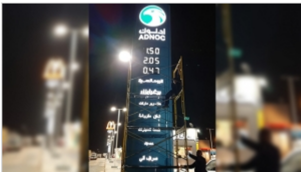
ADNOC Saudi-Arabien

When it comes to modern technology and innovative solutions, the Middle East is impressively open-minded, and this attitude also applies to the big players in the oil industry. However, price displays on fuel stations were not at all part of this mind-set. “No need” was the overwhelming feedback that Dr Max Krawinkel, CEO of PWM, received when travelling the region about eight years ago. Price displays, in general, seemed to be not important in highly regulated markets, and even less interesting were dedicated Price Change Units that not only display but also change prices effortlessly.