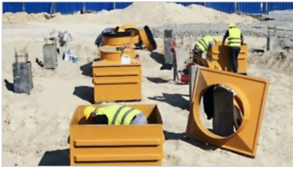
OPW products installed in Bulgaria for Lukoil, check out the case study

working together all over the world! Check out our latest retail fuelling case studies, and find out how we provided Lukoil Bulgaria with a long lasting below ground containment system, including KPS pipework and Fibrelite tank sumps. Read the full story HERE .