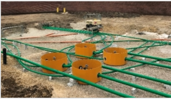
OPW products working together in the UK to streamline installation and minimise maintenance

to go from strength to strength operating under OPW leveraging our combined knowledge and portfolio.